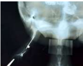
Figure4 Radiograph showed pin, screw, and wire for repairing fracture