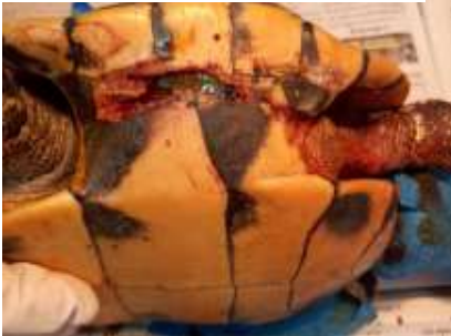
Figure 2 fracture of bridge of shell