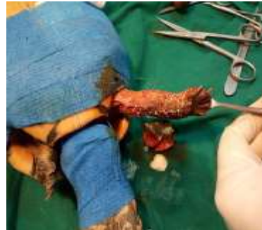
Figure5 Skin suture after operation