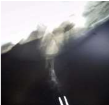
Figure 3 Radiograph showed intercondylar fracture of humerus and multiple ulnar fracture