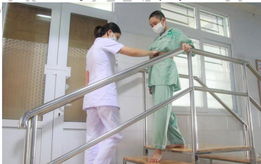
Fig 1- Nurse at Bai Chay hospital

And patients in stage 2 become higher proportion than stage 1