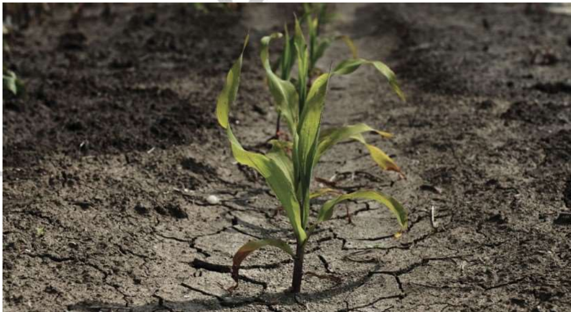
Note: Piping phase 06.07. 2019

As a visual manifestation of this, it is possible to satisfy the biometric measurements and phenological observations on the plant with the experimental variant, as a result of the prediction of the research we have undertaken under the sowing plant in the Shamakhi region of the region. [3,4]