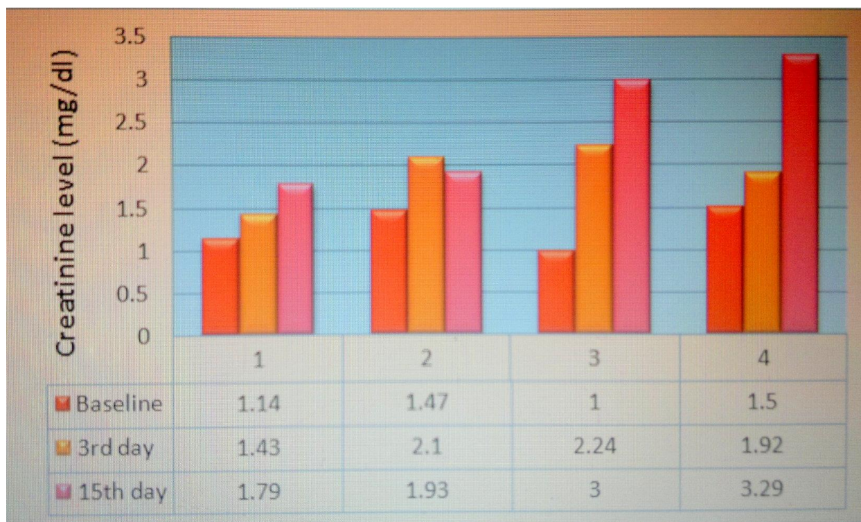
Figure 1. Graphical presentation of the Creatinine level before surgery and on the 3 rd and 15 th post – operative day.

Table 6 shows the 3 rd and 15 th post – operative day of BUN (Blood Urea Nitrogen) level. Experimental animal number 2 showed slightly above normal BUN level on the 3 rd post – operative day, and the rest remained on its normal range. On its 15 th post – operative day experimental animal number 4 has a BUN of 34.41 mg/dl slightly above the normal value while the remaining three were within the normal range. BUN blood levels become higher when the kidneys are not capable of filtering them out of the system, due to injury or the onset of a disease (Paretts S., 2013).