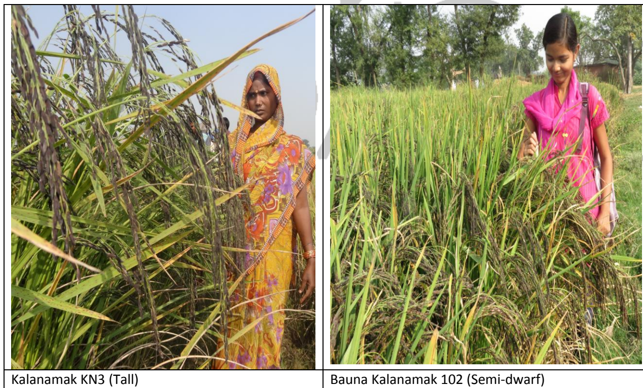
Fig. 3 Kalanamak KN 3 and improved Bauna Kalanamak rice crop grown in the GI area of U. P., India