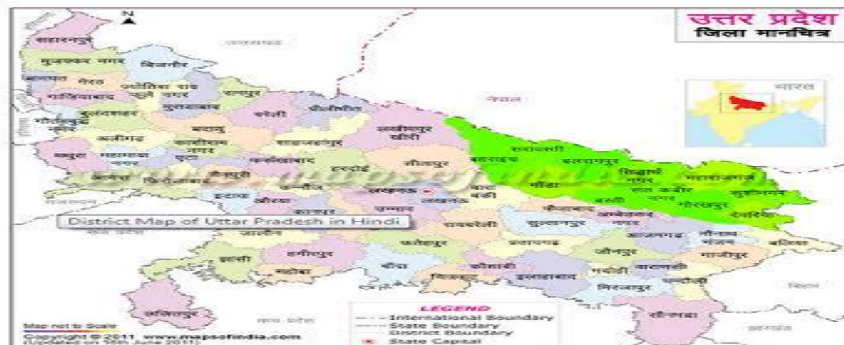
North-East plain zone of U.P. (highlighted in light green)

[Handwritten signatures and dates] 24/01/2013 24/01/2013 F. R. D. F. Gorakhpur